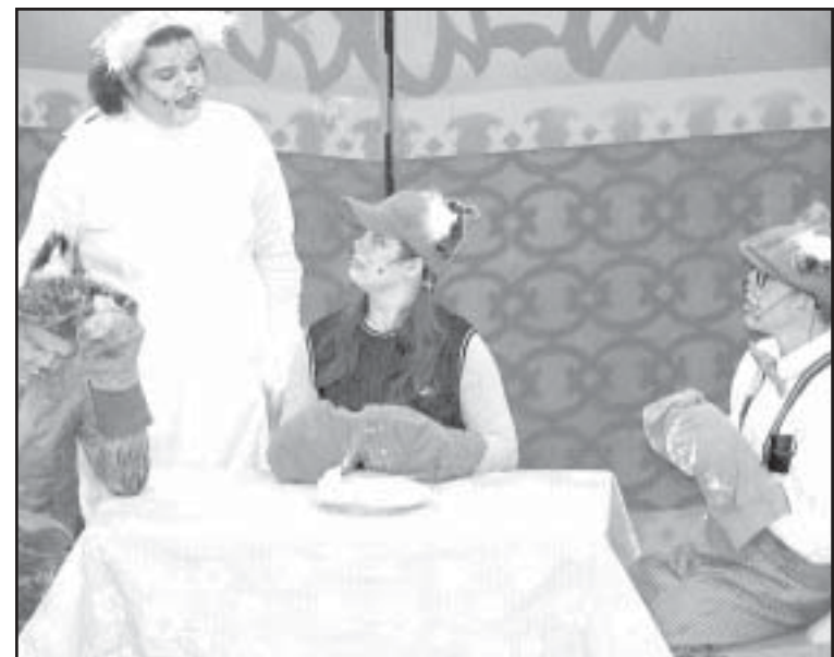
Mamma Cat, standing, chastised her "Three Little Kittens" for soiling their mittens in a performance Monday afternoon in Wilmeth Kirk Memorial Gymnasium.