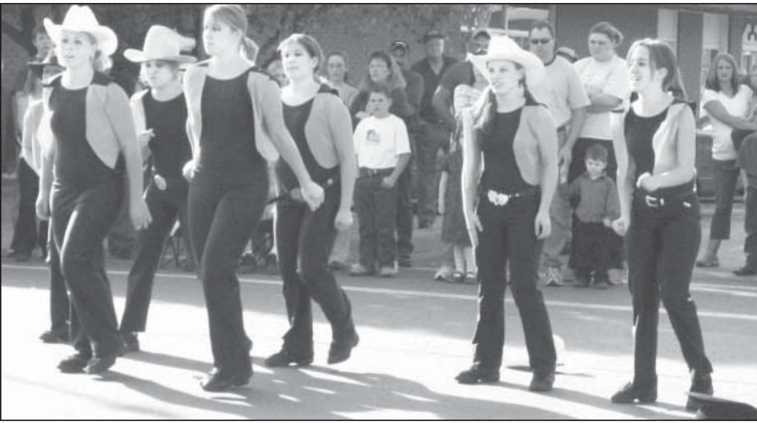
Cowboy hats on the Northern Valley dance team added a "kick" of country to their routine.