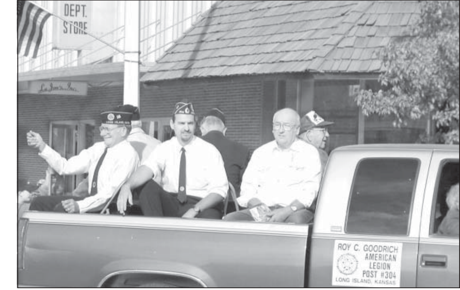
Members of the Roy C. Goodrich American Legion Post from Long Island represented their community by showing their pride in Friday's parade.