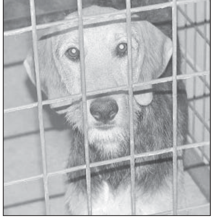
Gypsy, a female Airedale, was stolen from the Norton Animal Shelter sometime last weekend.

If you or someone you know has any information on the whereabouts of Gypsy, call the