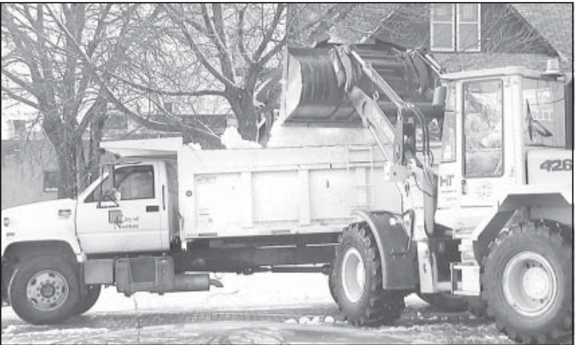
City crews were out Friday clearing the streets of piled snow from Sunday's blizzard.

There are two December specials. Special No. 1 is a premium foil-wrapped boneless turkey breast for $15 and one additional volunteer hour. No. 2 is 2 pounds of fully cooked shrimp and four 8-ounce choice sirloin steaks for $19 and one additional volunteer hour.