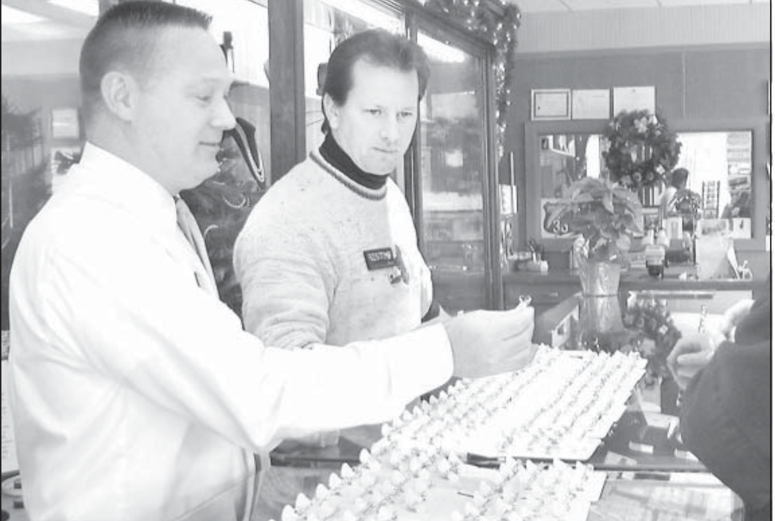
showed off a ring from his jewelry line to a shopper on.