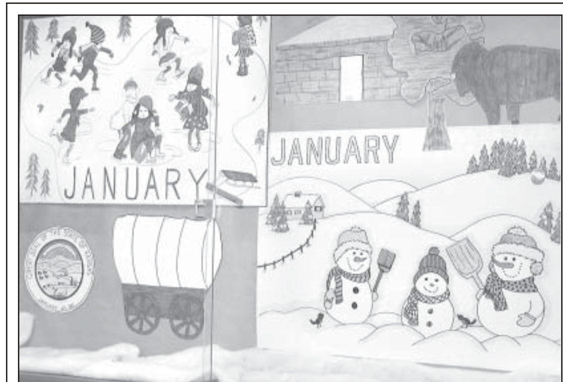
A winter scene in the main lobby display case greets visitors at Eisenhower Elementary School.

For more information about the auction or The Rock, call Trent Richmond at 871-0368.