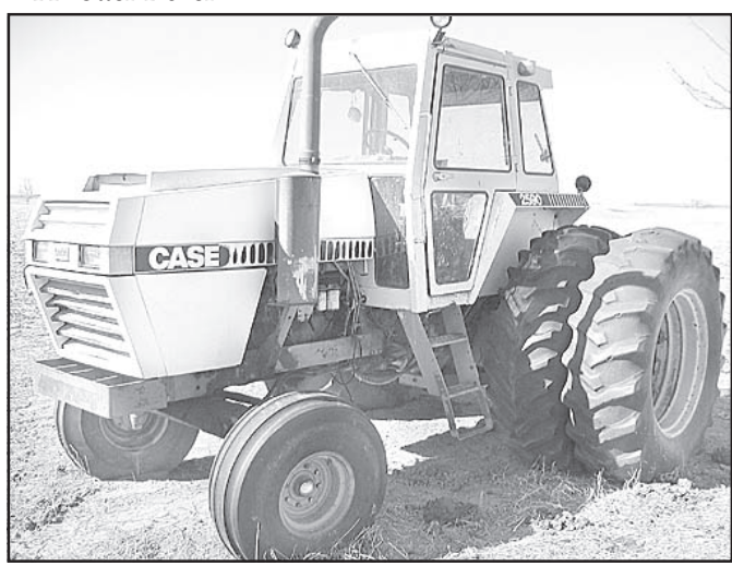
Case 2590 3 Point, 2 Hyd. Remotes 18.4 x 38 Duals

Steiger Super Wild Cat 3150 V-8 Cat 10 Sp., Serial #8650, Degelman 12' Dozer IHC 1586 3 Point, 2 Hyd. Remotes, 6750 Hours, 20.8x38 Rears, New TA and PTO (Subject to Prior Sale) Case 1370 3 Point, 2 Hyd. Remotes, 18.4x38 Duals, 11' Otter Dozer