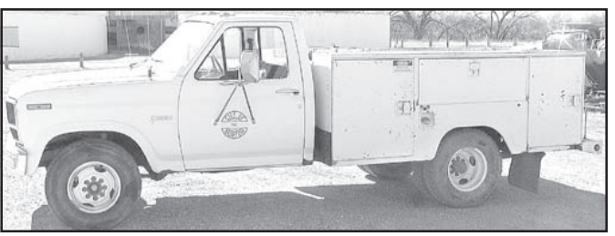
1984 Ford F 350 Dually 5.8 L V-8, 4 Sp., AM/FM, Stabl Utility Box (City of Norton)