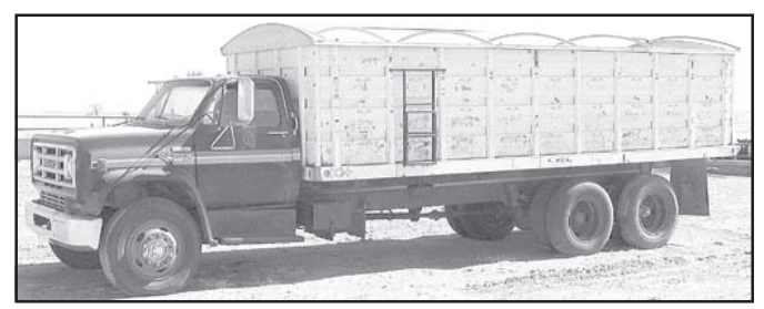
1978 GMC Sierra Grande 6500 453 Detroit 5 Sp., 2 Sp., Tag Axle, 22' Box and Hoist, Surlock Tarp

1952 Chevy 5 Window Cab, 13 1/2" Box & Hoist, 6 Cylinder 1965 GMC 4000 14' Box and Hoist, 4 Sp., 2 Sp., V6 900x20 Tires 1929 IHC Truck, 8' Wood Box, Good Body (No Engine or Transmission)