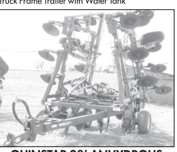
QUINSTAR 28' ANHYDROUS APPLICATOR (Like New)

Older Machinery for Salvage Truck Frame Trailer with Water Tank