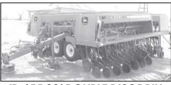
JD 455 30' DOUBLE DISC DRILL With Markers Krause 744A 34' Chisel with Blanchard Harrows

Versatile 5x6' Sweeps with Harrows, Anhydrous Versatile 8" Auger Westfield 80-51 8" PTO Auguer with Swing Mayrath 6" Auger Used Hydraulic Control for Anhydrous Out Auger Case 5 Bottom Plow RR Jacks JD 6 Bottom On land Plow 27' 6" Auger with Motor Case Rotary Hoe Case Magneto IHC Hay Rake Vermeer 605 D Round Baler Press Back Chairs Shop Built Gooseneck Trailer w/16' Box & Hoist