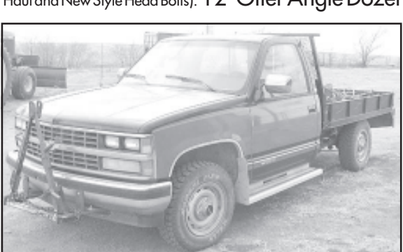
1989 CHEVY 1500

3 Pt., Quick Hitch 3 Hyd., 18.4 x 42 Duals, Rear Weights, 7637 Hours. (1000 Hours on Under Haul and New Style Head Bolts). 12' Otter Angle Dozer