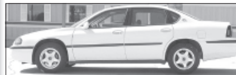
2005 CHEVY IMPALA - 4 dr., 3400 V-6, cloth interior, dual temp, CD, white, 14,000 miles, factory warranty.