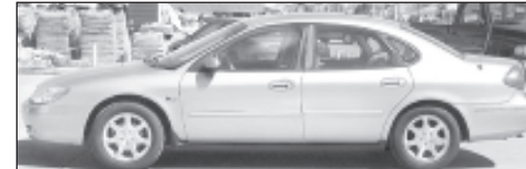
2000 FORD TAURUS SE - 3.0 V6 auto, loaded out, nice, clean, local trade, gold.