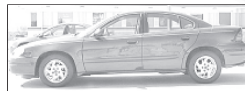
2003 PONTIAC GRAND AM SE - 4 dr., V6 auto., CD, nice cloth interior with only 42,000 miles, dark green metallic.