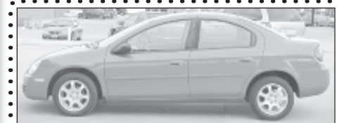
2005 DODGE NEON SXT - 4 dr., 2.4 4 cyl., 6 disc CD, red, auto, nicely optioned, only 16,000 miles. Great going "off to school car", factory warranty. WAS $12,600.00 ..... NOW $11,200.00