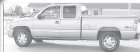
2003 GMC - SLE Ext. Cab, 4 dr., 271, 5.3, V8, cloth interior, 4x4, loaded-every option, 23,000 miles.

(120) 18 month old registered Angus bulls, LBW, extremely high growth, weaning and yearling EPD's in the top 2% of the breed. Average EPD's on sale bulls are 2.5 54 20 96. Nemeth Angus, 785-322-5505/785-626-4309. — 3/29 & 4/5 —