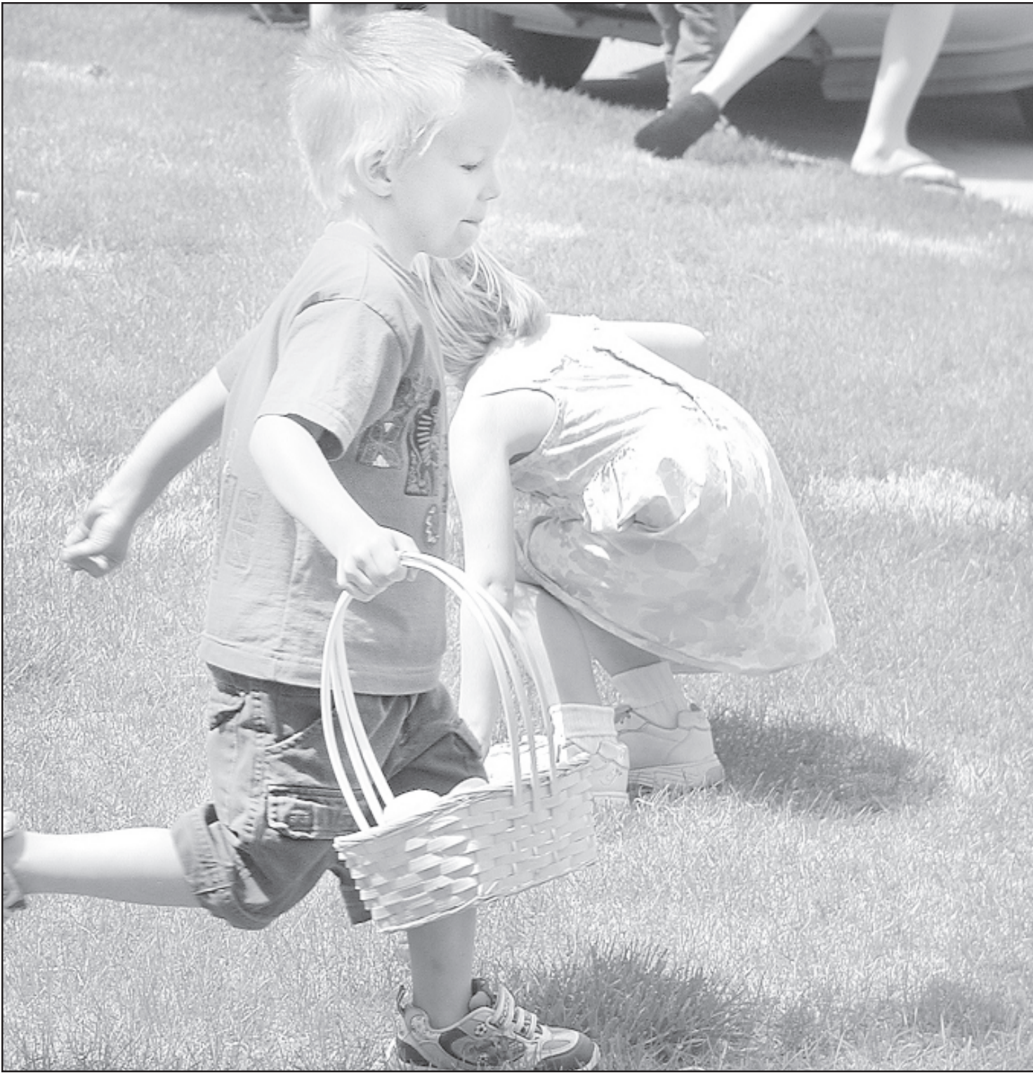
Children of all ages were running to and fro trying to find and pick up every candy filled egg they could Saturday afternoon during the annual Easter Egg Hunt in Norton. The courthouse lawn was packed with the young hunters, while their parents watched.