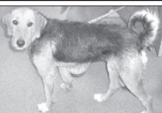
"Gypsy" - Female Airedale, 1-2 yrs. old

Dogs will be started with obedience training and house-breaking. Vaccinations and spay/neuter will be completed. There will be an adoption fee required for each dog.