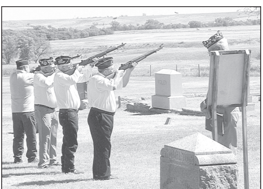
Men from the Danbury, Neb., American Legion conducted Memorial Day Services at Lyle Cemetery. Members of the firing squad fired a salute to their fallen comrades before children placed flowers on veterans' graves