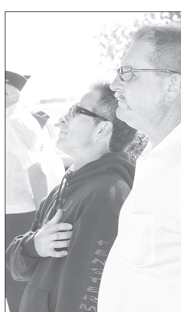
Hands were held over hearts as patriotic songs were sung.