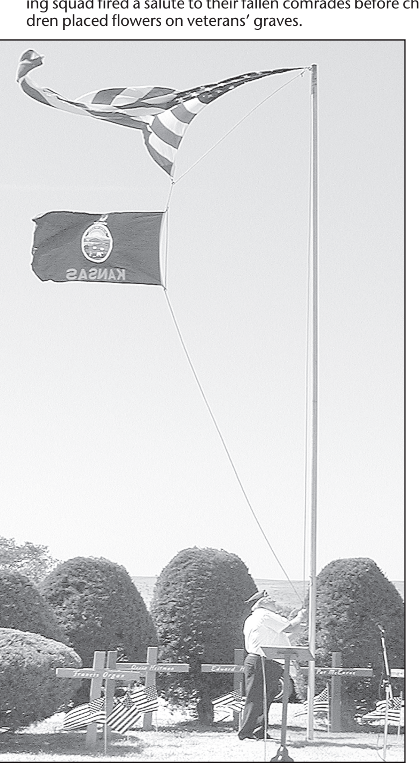
The American and Kansas flags blew in the wind after being raised at the Lenora service.