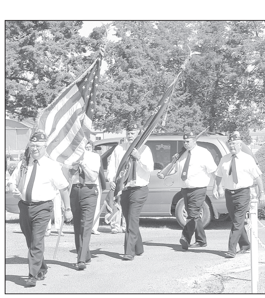
Members of the Norton American Legion honor guard led the way out of the Norton Cemetery after the services were finished.