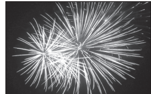
People will be able to ooh and ahh Tuesday when the sky is lit up by fireworks, put together by the Norton Chamber of Commerce.

Viewing of the fireworks will be best from Prairie Dog State Park. Bring lawn chairs, a picnic and come early enough to get a good spot for the show.