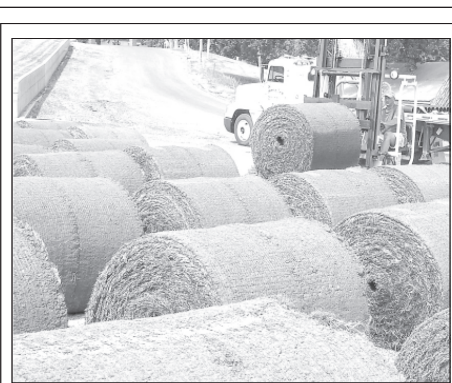
The Norton School District is "overhauling" the football field. On Thursday, 30,000 square feet of the 60,000 square feet of sod arrived in Norton. Each roll of sod is 4 feet wide and 120 feet long.

George Land, a pilot for Valley Hope, (Continued on Page 5)