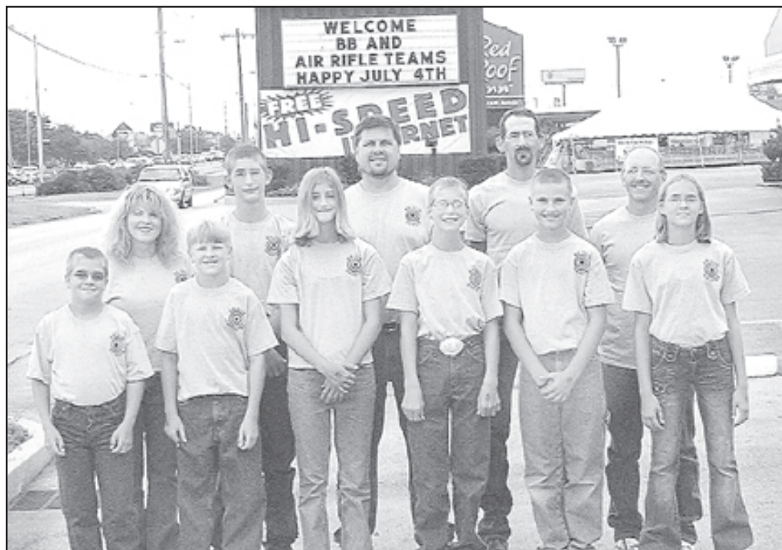
BB Gun team members and coaches were welcomed at motel

THIS PAGE BROUGHT TO YOU BY THE NORTON TELEGRAM AND THESE COMMUNITY MINDED BUSINESSES