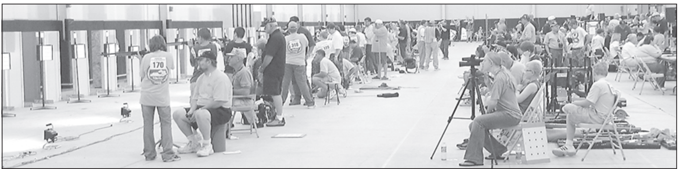
This photo taken on the shooting range in Diddle Arena shows the three tiers of activity during firing from the standing position. At left are the shooters and coaches on the firing line, at right are other team personnel checking shooters' scores and next relay shooters and, at far right, some of the team personnel can be seen grading targets.