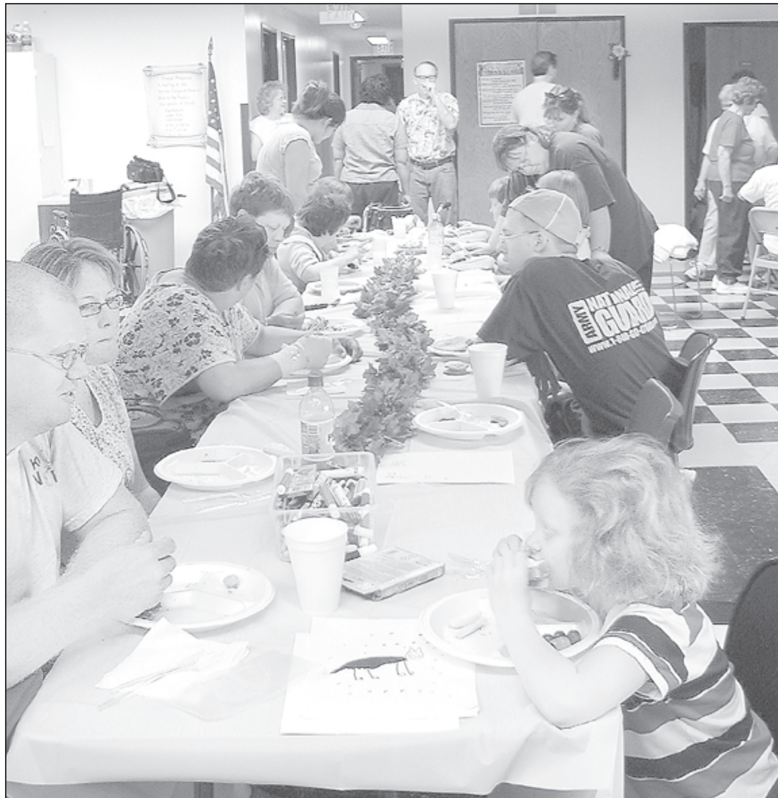
Friends, families, consumers and guardians shared a meal during the annual open house for Disabled Services of Northwest Kansas held last Saturday.