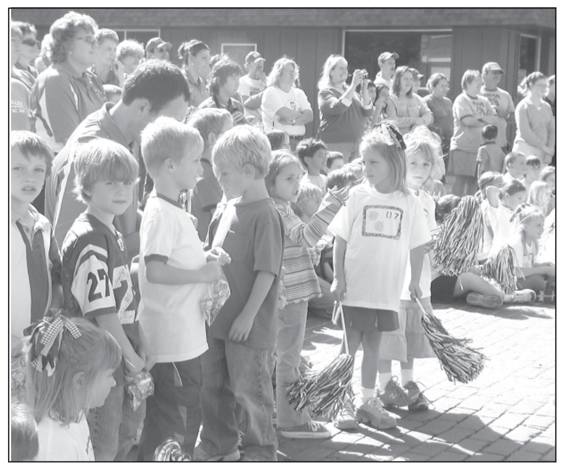
Northern Valley sports fans gathered for the homecoming parade and pep assembly at an intersection in downtown Almena Friday. These children were part of the cheering section.