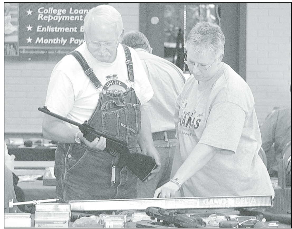
Collectors of guns, knives and other odds and ends found what they were looking for at the annual Norton Gun Show last weekend.