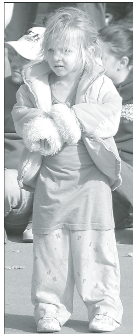
This little windblown cutie waited patiently to catch some candy during the Veterans' Day parade.