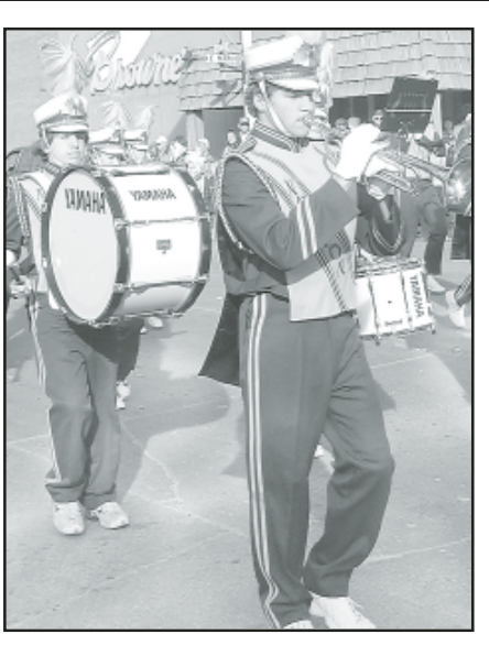
Members of the Norton Community High School marching band played rousing patriotic music as they paraded down State Street.