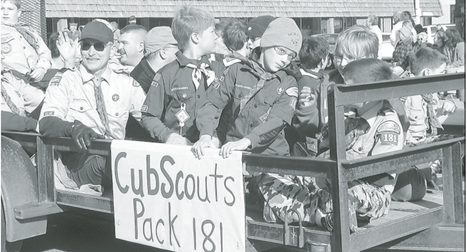
A trailer full of Cub Scouts and leaders rode in the Veterans' Day parade.