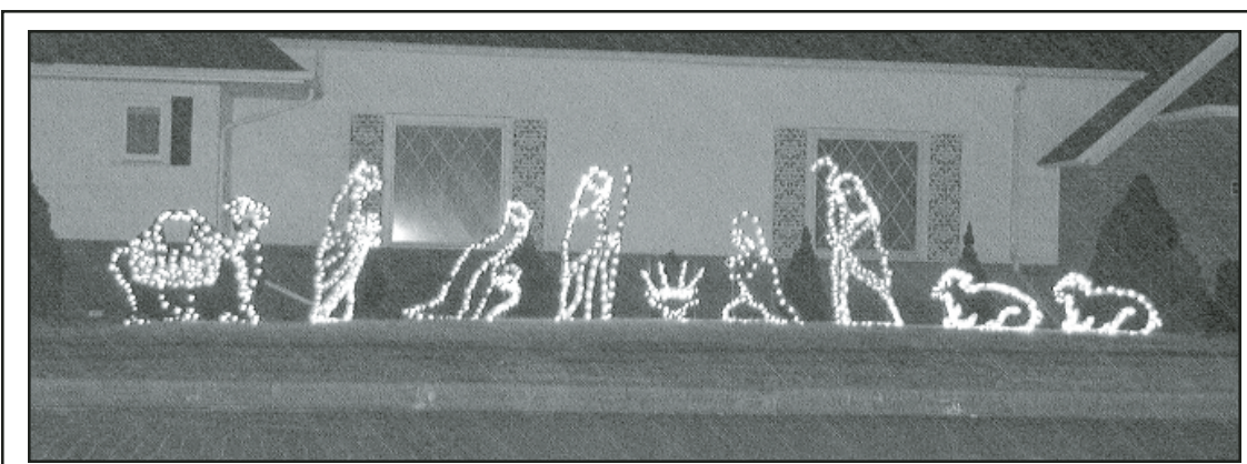
The Christmas story told in lights. These lighted figures can be found on the front lawn of Enfield's Funeral Home, 215 W. Main.