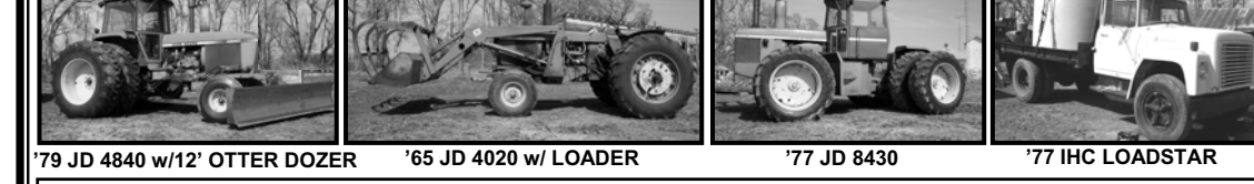
'79 JD 4840 w/12' OTTER DOZER '65 JD 4020 w/ LOADER '77 JD 8430 '77 IHC LOADSTAR

AUCTION LOCATION: From Norton, KS, go West on Hwy 36 to Road W11 at Reager, then 10 miles North to Road C, then 1 mile West to the sale site. SIGNS WILL BE POSTED!