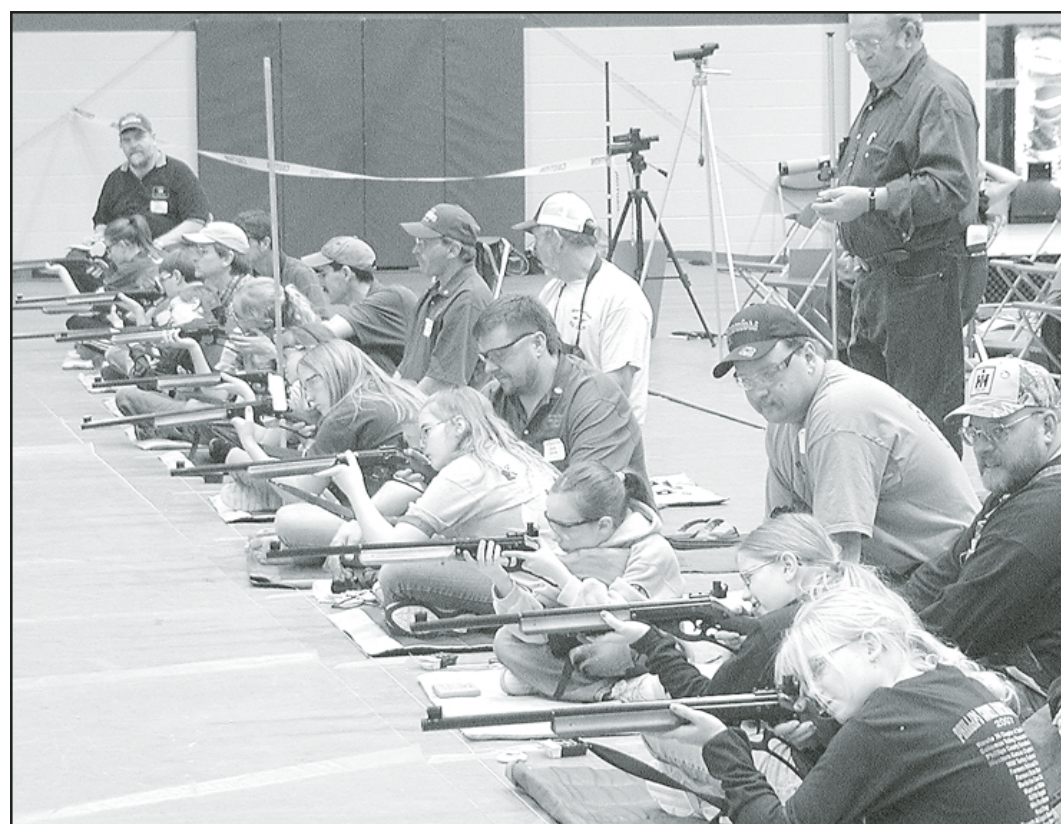
Young girl and boy marksmen and their coaches are shown on the firing line as they competed from the sitting position during the Kansas Jaycees State BB Gun Championships on Saturday in Manhattan.