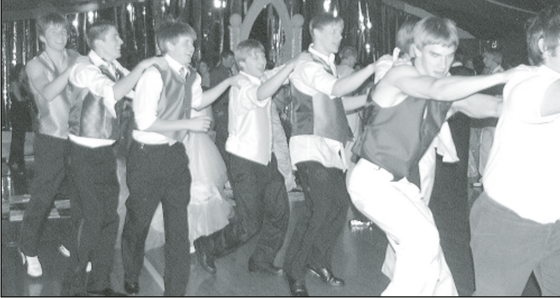
Mostly guys formed the Conga line that snaked its way in and out of the gymnasium.