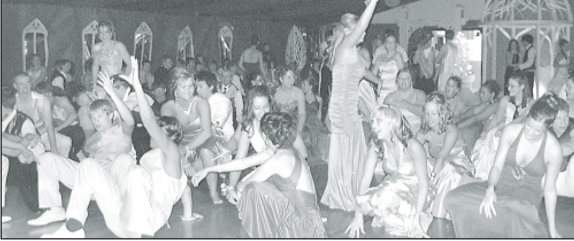
Ashes, ashes, all fall down. At least most of the dancers at Norton's Prom Saturday night were doing the same dance.