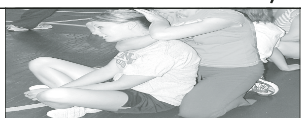
Next week celebrates children, daycare

to help baby The Norton Area Chamber of Commerce is sponsoring a baby shower for a young mother in need. The baby is due in June. If you would like to help, please contact the Chamber at 785-669-2556. School dismisses early Monday The Norton Area Chamber of Commerce is sponsoring a baby shower for a young mother in need. The baby is due in June. If you would like to help, please contact the Chamber at 785-669-2556. Northern Valley celebrates prom The Northern Valley Forensics team celebrated their annual prom on April 13. The event was held at the Phillipsburg High School. The team had a great time and had a successful evening. Rural Telephone The Norton Area Chamber of Commerce is sponsoring a baby shower for a young mother in need. The baby is due in June. If you would like to help, please contact the Chamber at 785-669-2556.