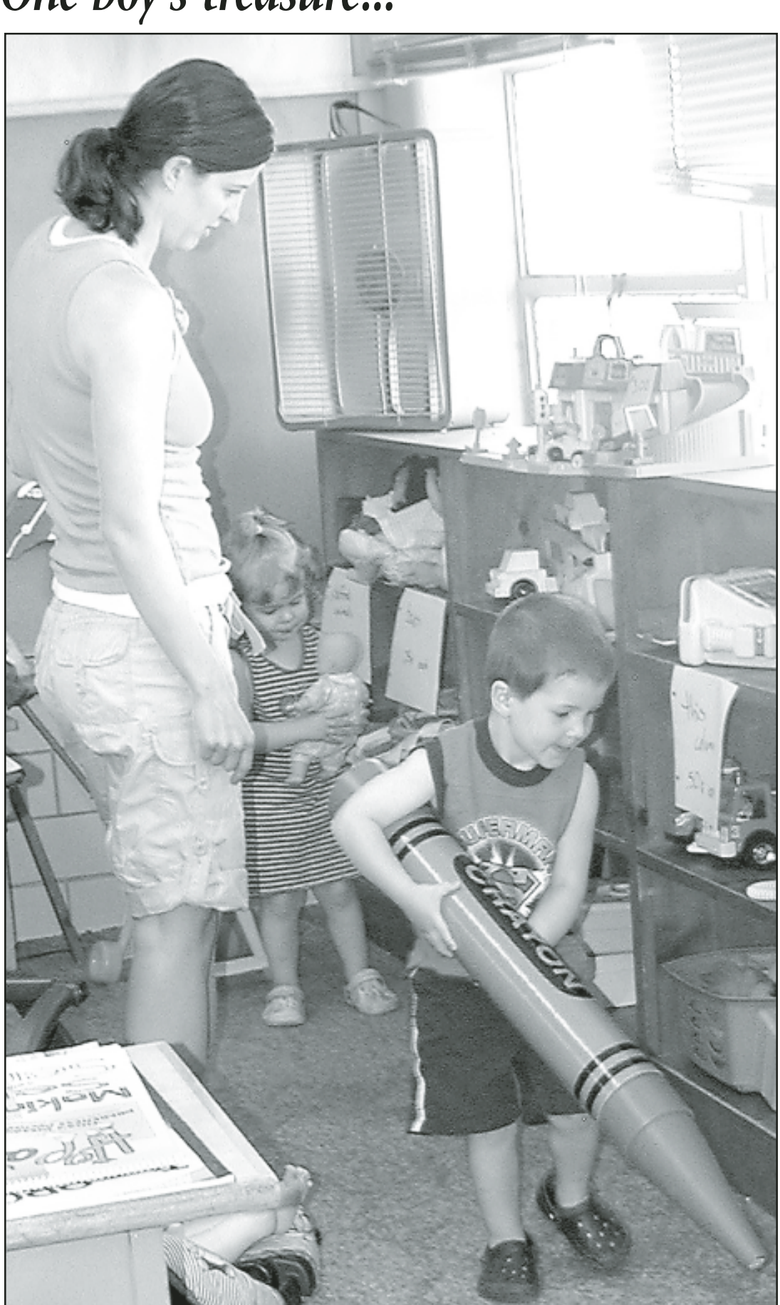
Shoppers browsed through the merchandise at one of 23 garage sales held Saturday in Norcatur during the second annual city-wide garage sale.