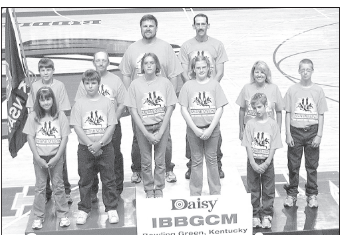
Norton BB Gun Team was introduced during Opening Ceremonies