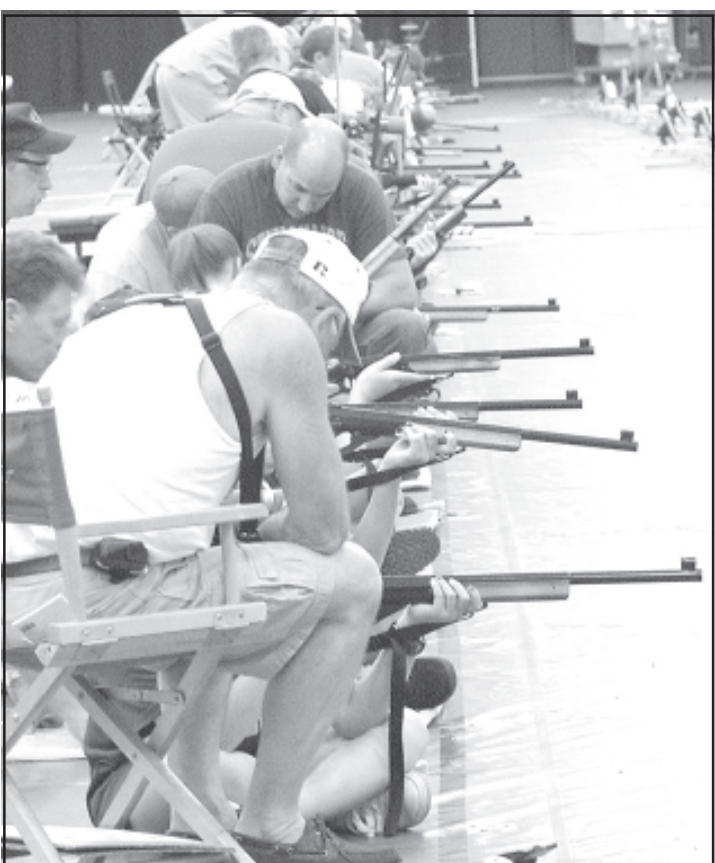
This photo taken looking down the firing line in Diddle Arena shows coaches and shooters as they competed from the sitting position.