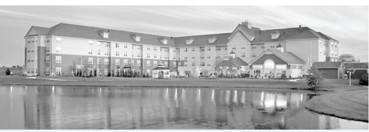
My weekend set on autopilot. My Homewood.

REMINDER — Judging results from the State Fair can be accessed from the Internet at the web address www.oznet.ksu.edu/ksfair/ .