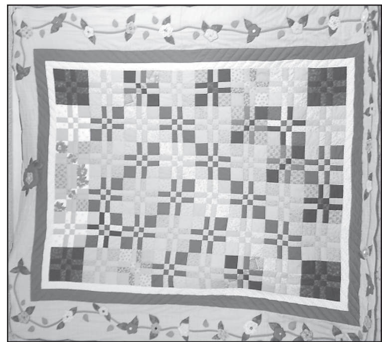
One of the many quilts auctioned at the New Almelo Bazaar held Aug. 11 at the New Almelo Parish Hall.