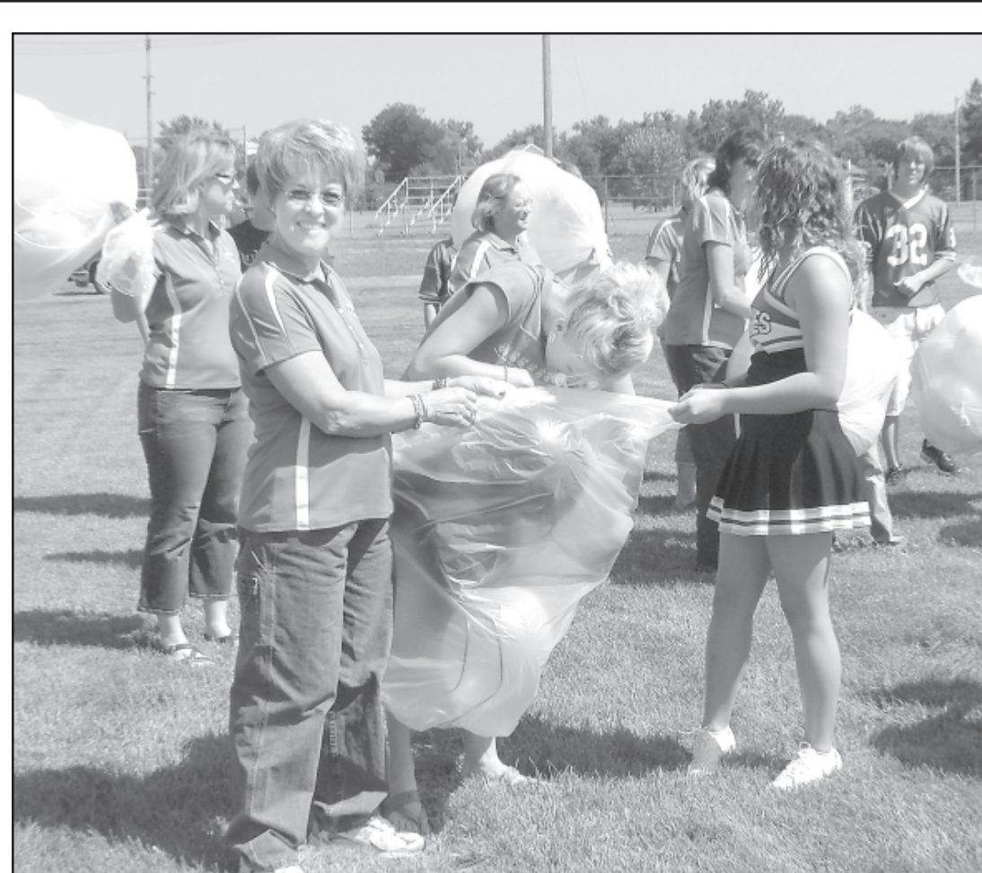
Purple and gold, black and orange, and green and white balloons were released as part of the Northern Valley School District's 40th birthday party on Aug. 31.

*Independent Licensee of the Blue Cross and Blue Shield Association