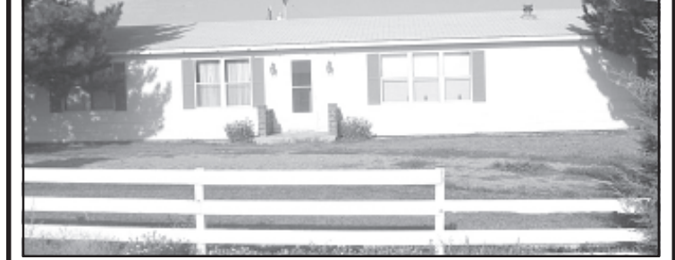
All this is setting on approx. 10 acres with a great country view!

There is also a 40 x 70 Morton Machine Shed with partial concrete floor, office area and a loft. This building has 2 walk-in doors and the large sliding doors.