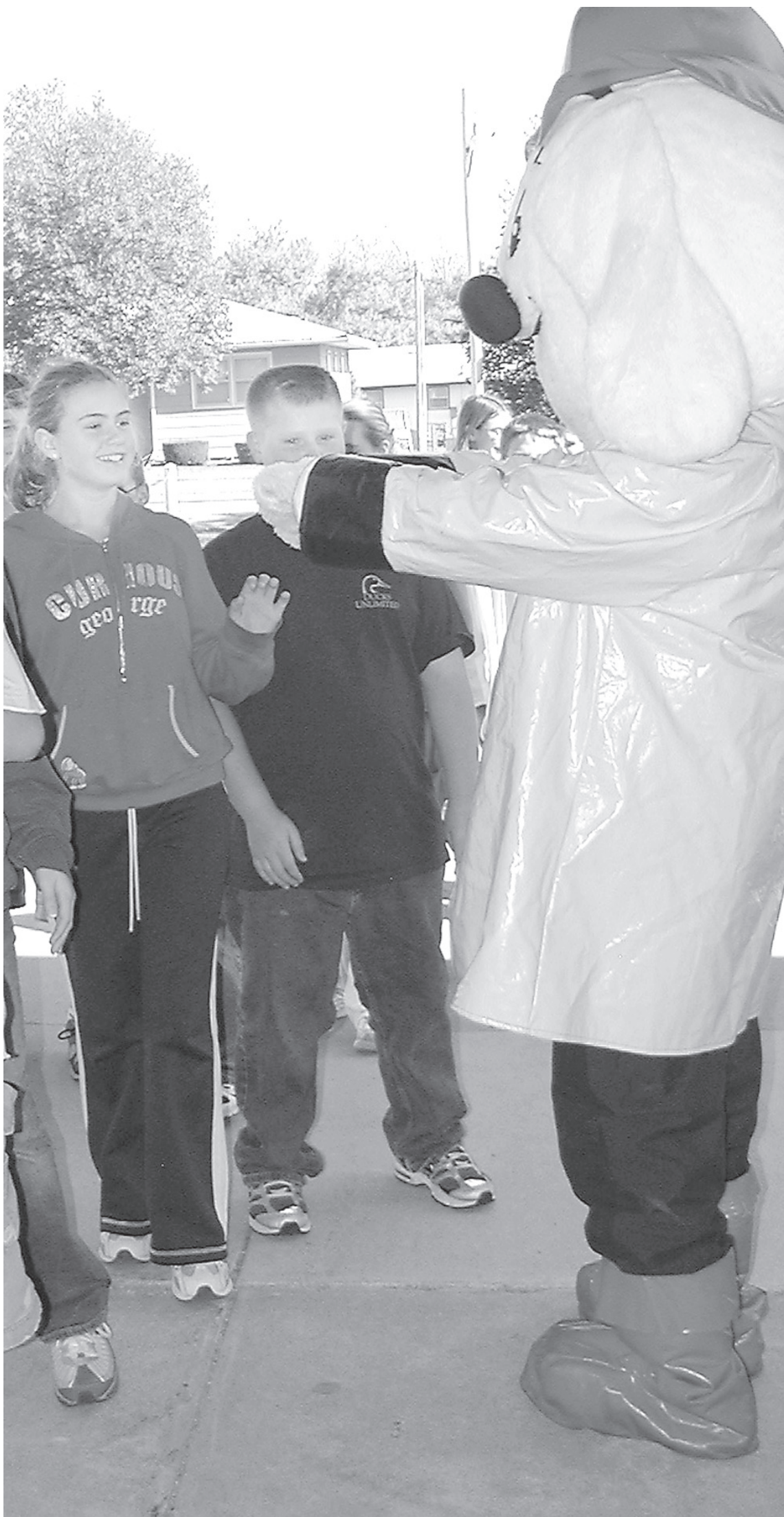
Sparky The Fire Pup was popular with students at Eisenhower Elementary School Thursday after he helped present a fire safety program.

Logan 68, Palco 22 Trego 14, Hill City 12 LSU 28, Florida 24 Missouri 41, Nebraska 6 Oklahoma 28, Texas 21 Illinois 31, Wisconsin 26 Maryland 28, Georgia Tech 26 Oregon State 31, Arizona 16 Kansas 30, Kansas State 24