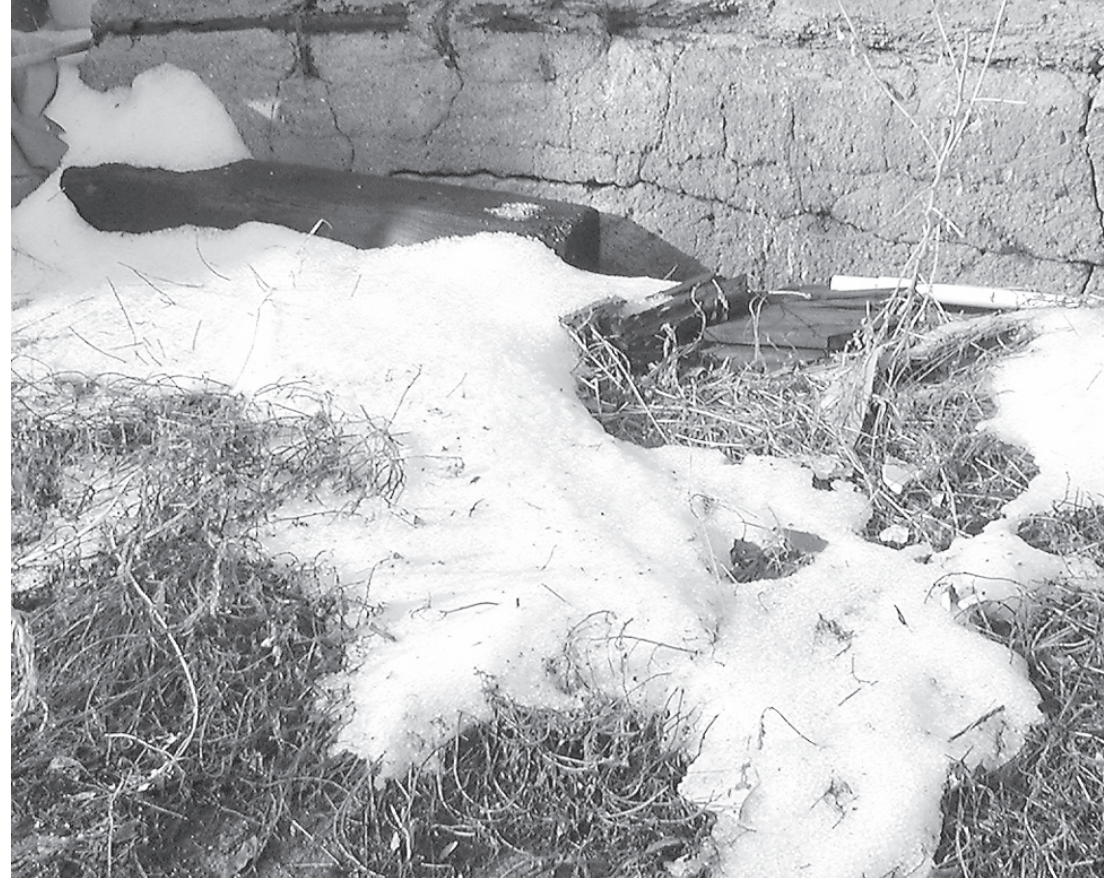
Hail drifted like snow in the alley north of The Carter Building after a rain and hail storm blew through Norton County last Wednesday afternoon.