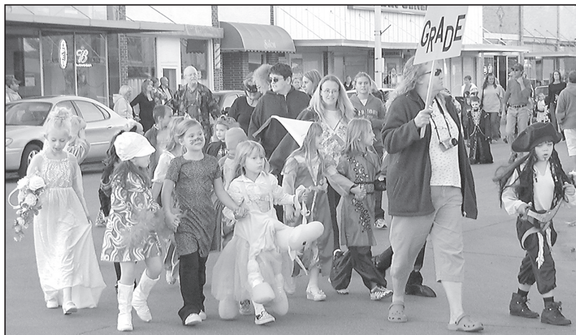
First graders all dressed up huddled together during the parade Thursday.