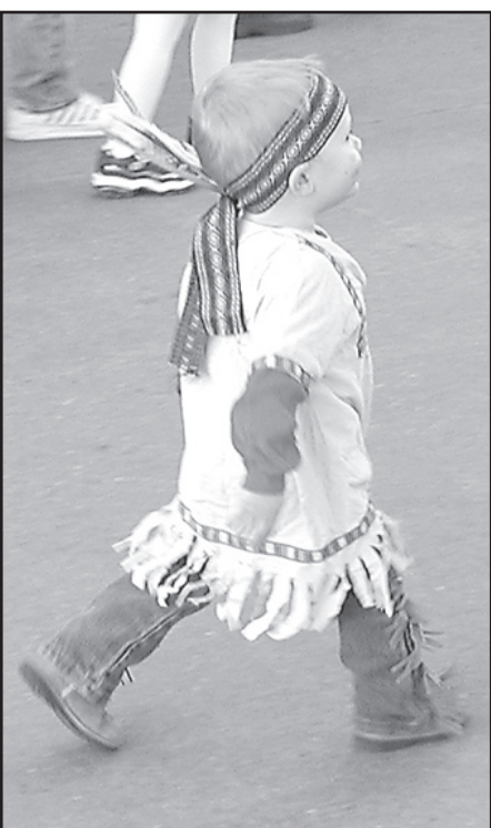
This little Indian walked proud and tall like a true warrior during the parade.