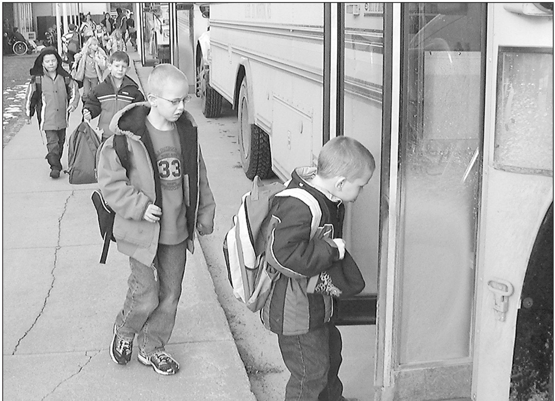
The students of Eisenhower Elementary rushed to find their buses when school let out Monday. It was their first day back from the winter break.