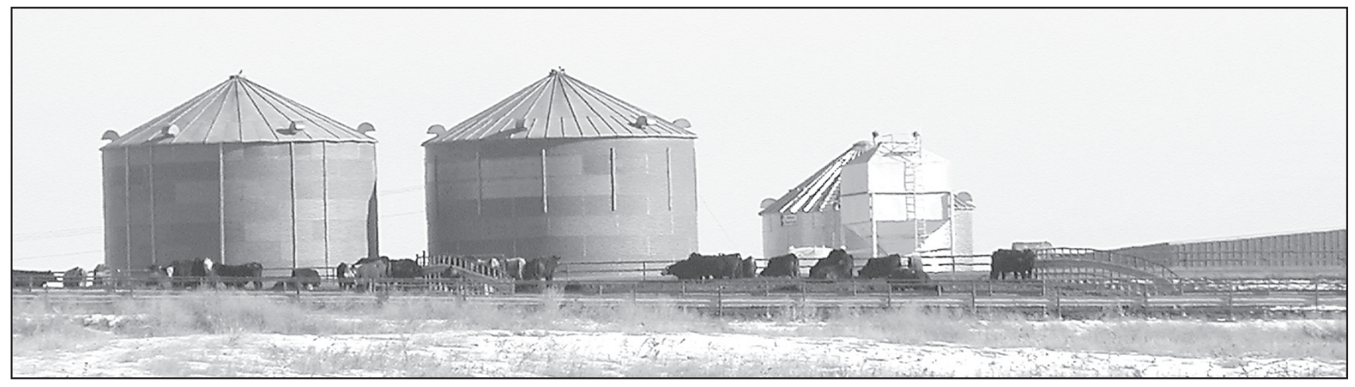
Esslinger Ranch is to be honored as the Kansas Bankers Association's 2007 Soil Conservation winners. Part of the reason the ranch was cho-