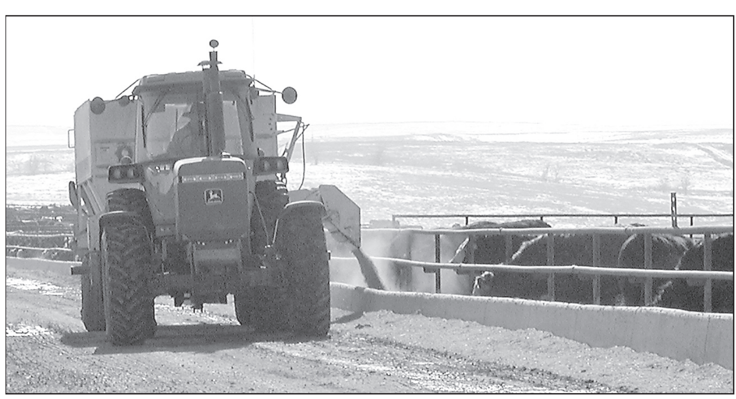
sen was the new feedlot built to hold a maximum of 3,500 head with a more up-to-date waste system.