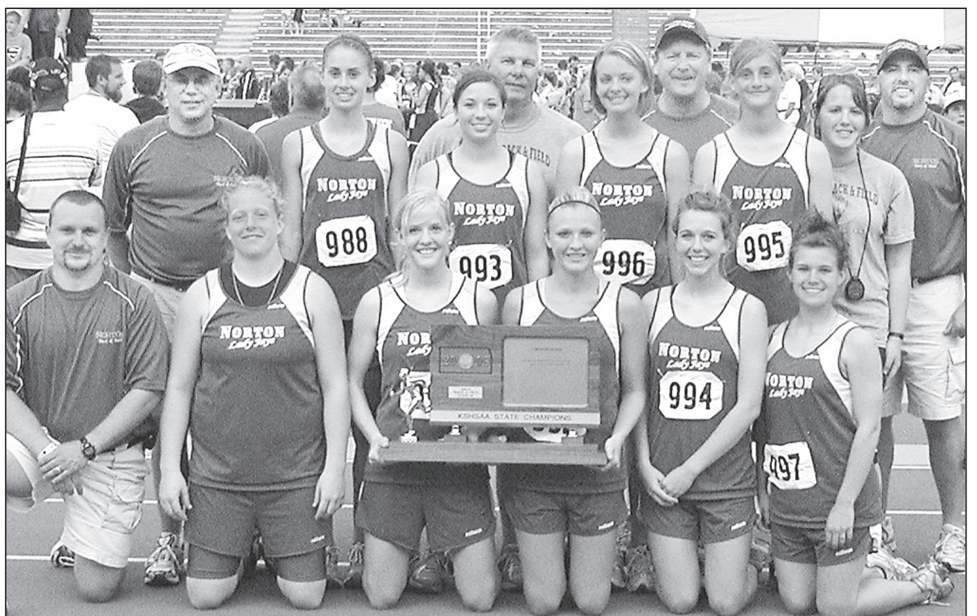
NORTON COMMUNITY HIGH SCHOOL WOMEN'S TRACK AND FIELD TEAM —

... to our NCHS Women's Track Team and Coaches on Winning the 2008 3A State Championship!