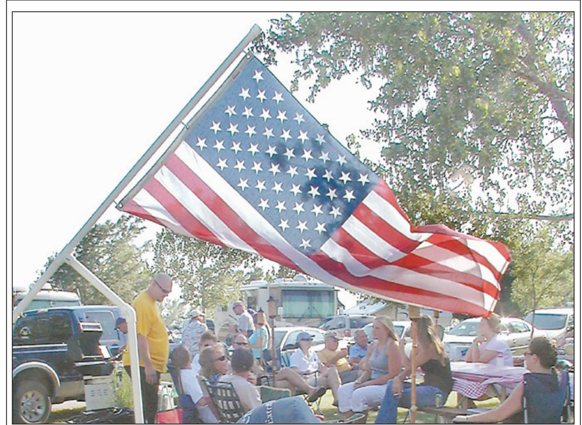
Good food, good friends and Old Glory waving in the breeze. Picnic sites like this were all over Prairie Dog State Park at the Fourth of July celebra-

Ever-present God, even in the most difficult times, help me remember that you are surrounding me with your love and presence. Amen