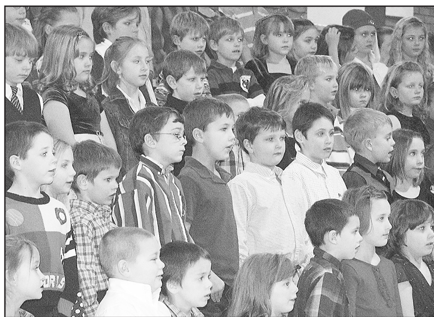
Eisenhower Elementary performed their Winter Concert last week. The students sang songs from "The Nutcracker Suite"