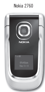
Nokia 2760 Capture vibrant videos and images!