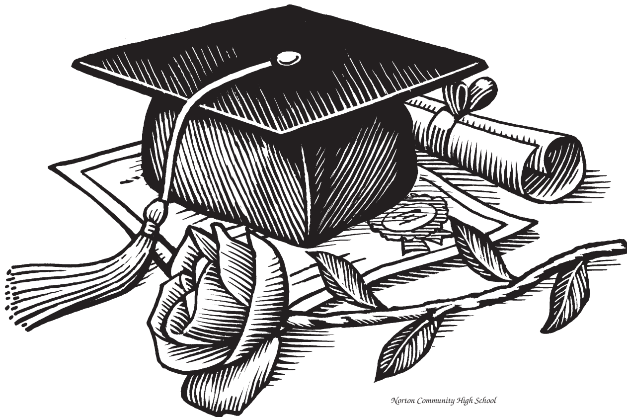
Norton Community High School