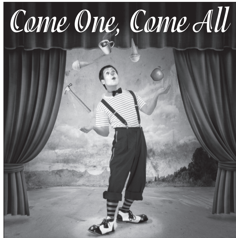
Come One, Come All

Don't allow the blood of Jesus to be wasted in your life. Receive Him into your heart by asking forgiveness of your sins. His sacrifice covers them ALL! He will set you FREE!