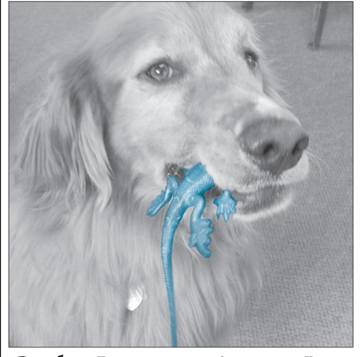
Boxler Insurance Agency, Inc.

We won't leave your money laying around . . . We give you the best deal we can to start with!