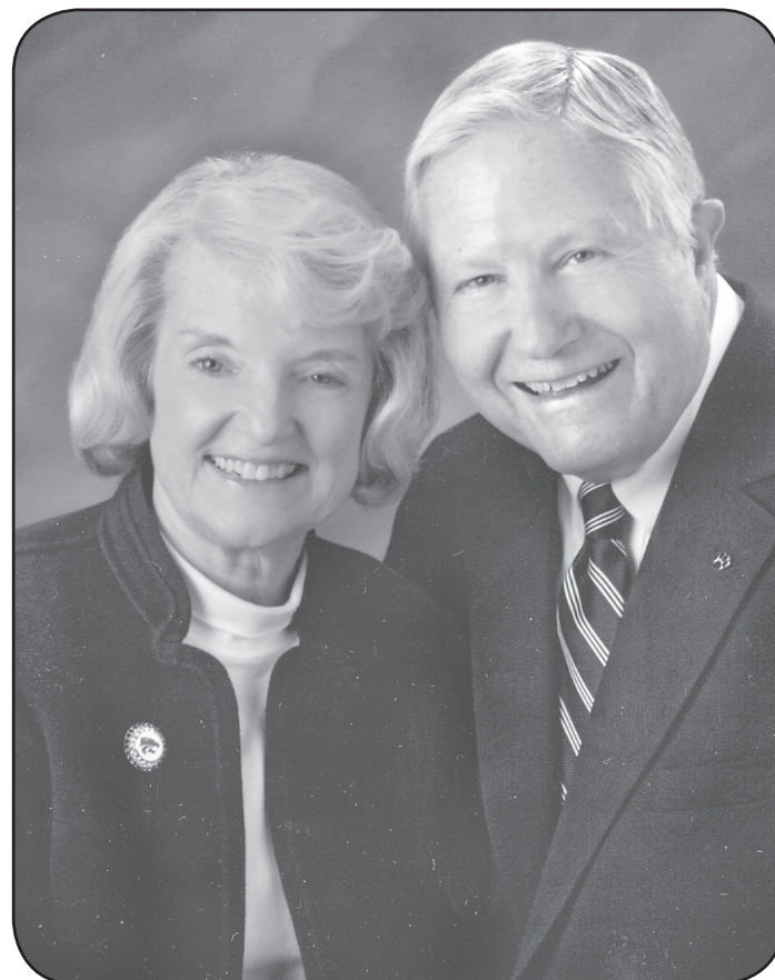
~ 2009 ~