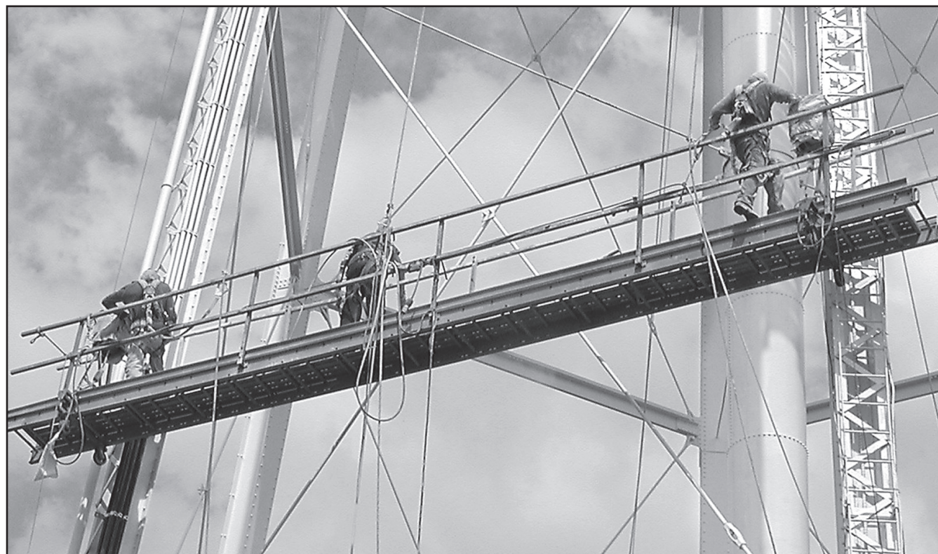
Miller & Associates employees continued painting the side of the Norton water tower yesterday. Work on the tower is continuing this week. The roof has been completed, but a lot of work remains. Water is continuing to flow out of fire hydrants to relieve the pressure on the water pipes.