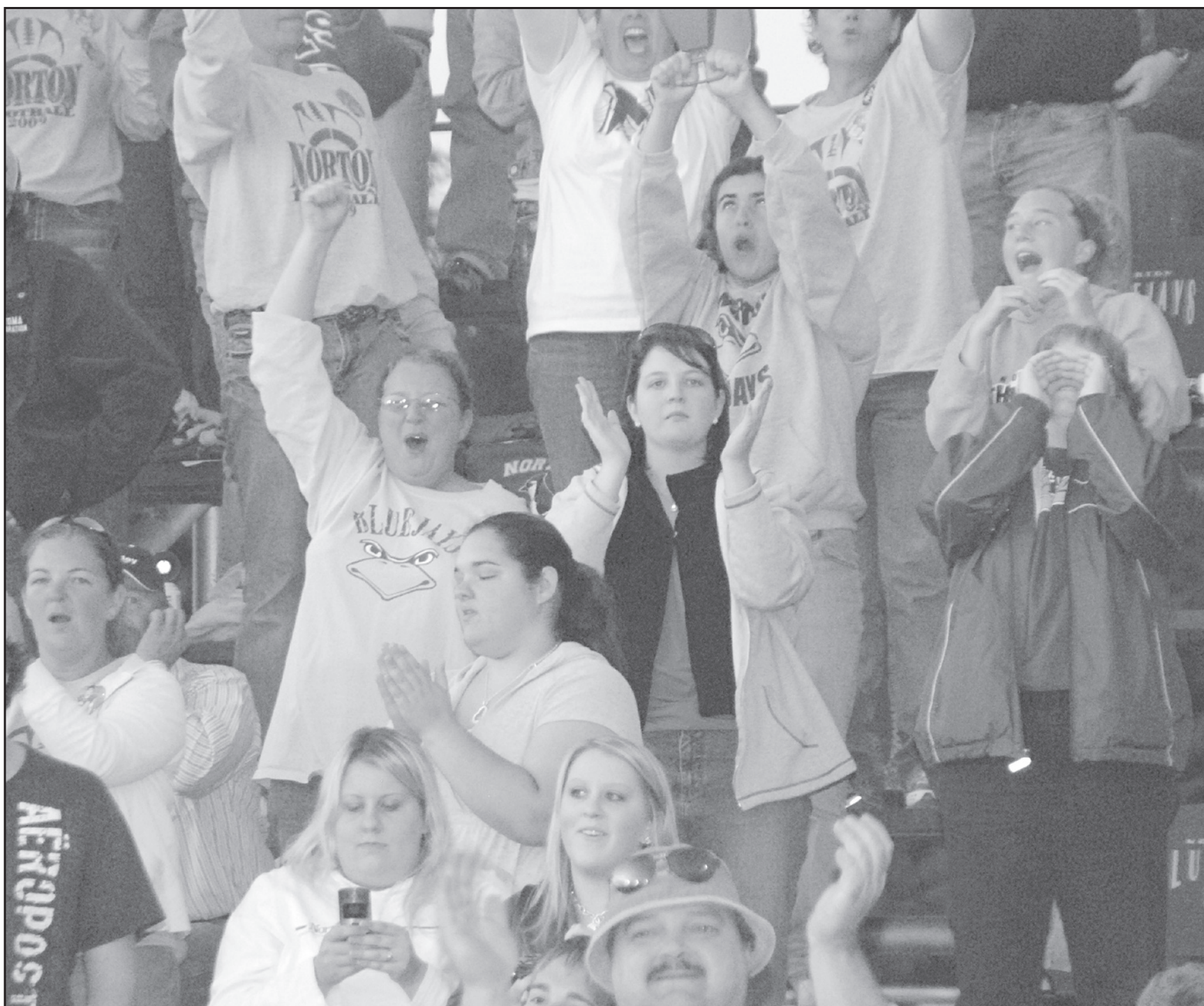
Norton fans are enthusiastic in supporting their "fighting Blue Jays"!