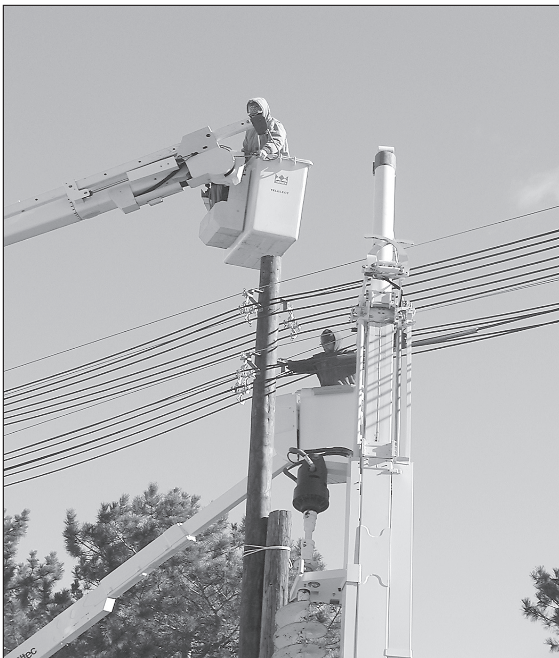
Brian Hickman replaced a broken pole across from Walter Motor due to a recent wind storm. City crews were out after the storm fixing damage.