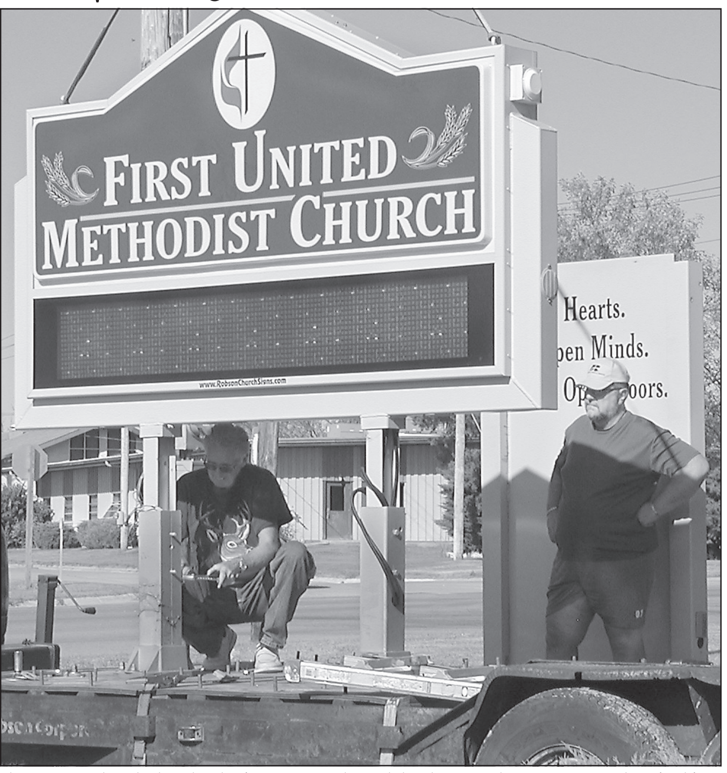
The First United Methodist Church of Norton recently and church events. The grant was a matching fund from received a grant for a new electronic sign. The sign, located United Methodist Communications. on Highway 36, includes an LED message display. The church plans to use the sign for regular announcements,