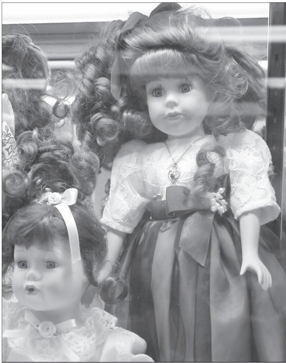
These are just some of the many dolls that Dawn Herring has collected and are displayed currently at the Norton Library.