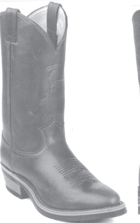
Oiled Leather, Vibram® Sole Made in U.S.A. Cushion Insole $149.00 Chippewa® #20012 Leather Lined