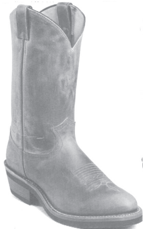
Full Grain Leather, Vibram® Sole Made in U.S.A., Texon® Insole $145.00 Chippewa® #29300 Leather Lined