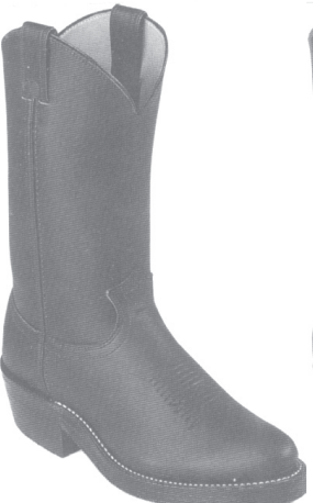
Black, Vibram® Sole Made in U.S.A., Texon® Insole $135.00 Chippewa® #26791 Leather Lined