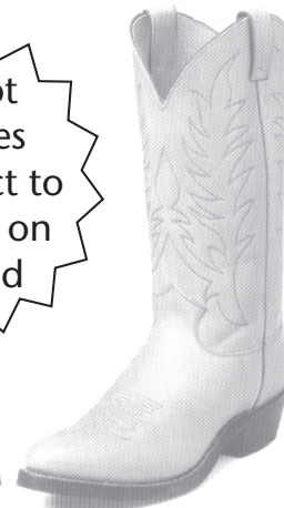
Mulehide, Work Sole Made in U.S.A., Cushion Insole $135.00 Justin® #1122 Leather Lined